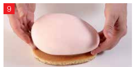
• Put the preparation on the sponge base.