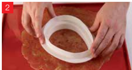
• Cut the gelatin with the inside cutter.