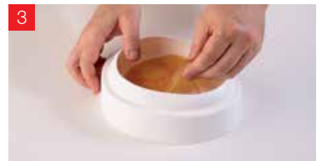
• Insert the gelatin.