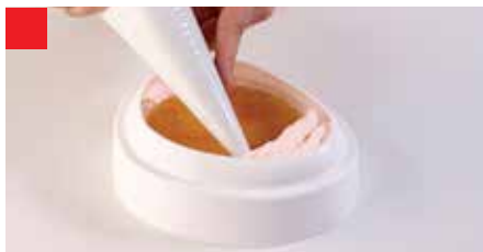
• Fill up the mold to the top.