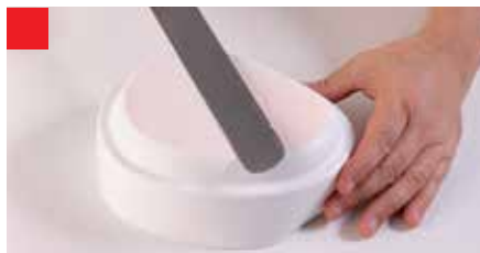
• Level and put in the blast chiller.