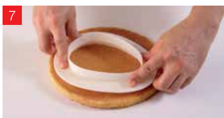
• Cut the sponge base with the outside cutter.