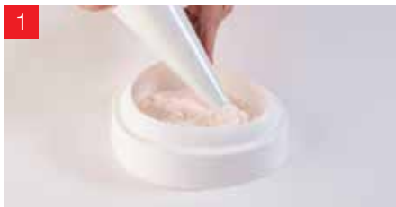
• Fill half of the mold with the preparation.